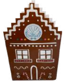
Gingerbread house page 22