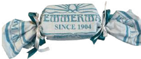
Tea towel page 19