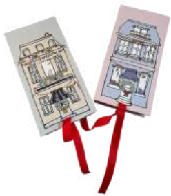
Christmas boxes pages 1 to 5

All examples in this catalogue can be tailored to your preferences, incorporating your favorite products and aligning with your budget.