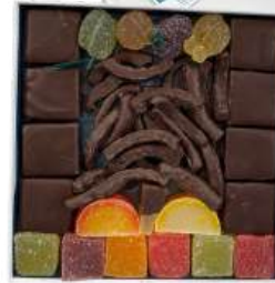
Chocolate boxes pages 10 - 12.