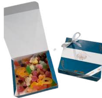
Gum box page 22