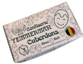
Cuberdondooes at 23

please contact: info@temmermanconfiserie.com