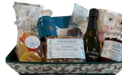
Gift basket pages 23 - 24