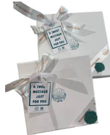
Luxury praline box pages 13 - 15