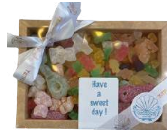
Candy box at 25