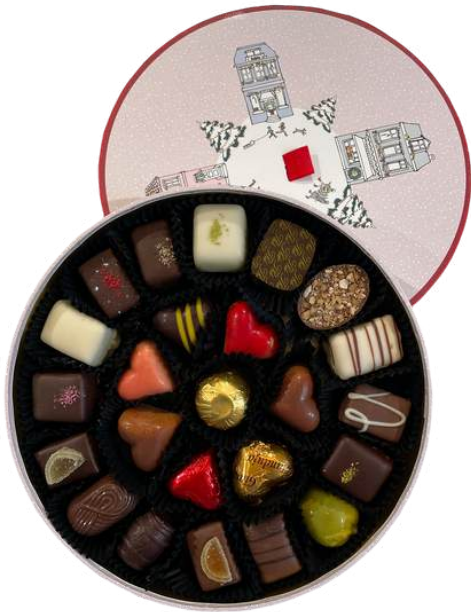
Praline Circle Weight: 350g Price: €35