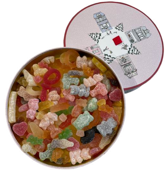
Candy Circle Weight: 500 grams Price: 25 euros