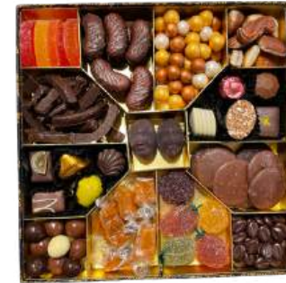
Dessert Box at 16