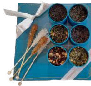
Tea box page 26