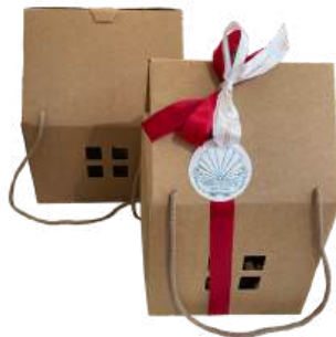
Candy houses pages 20 - 21