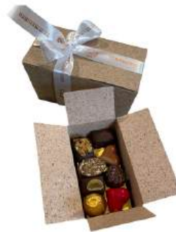
Ballotins page 38