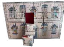
Advent calendar page 6