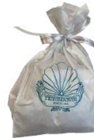
Smuggler bag page 28