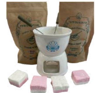
Hot chocolate pages 36 to 37