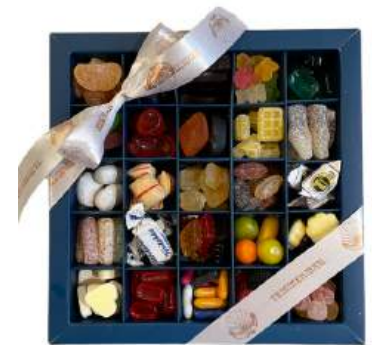
Smuggling box page 11