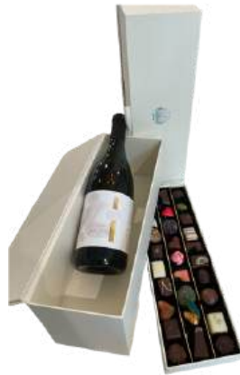
The White Box page 18