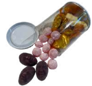
Gentse Tubo at 35