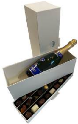
Champagne case page 17

please contact: info@temmermanconfiserie.com