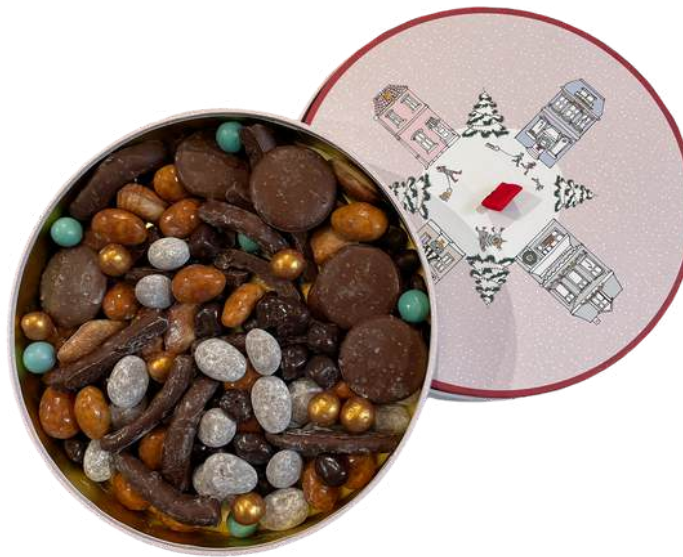
Chocolate mix circle Weight: 460 g Price: €35