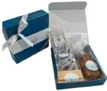
Mix boxa page 30