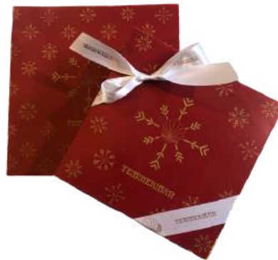
Best of Box pages 7 to 9