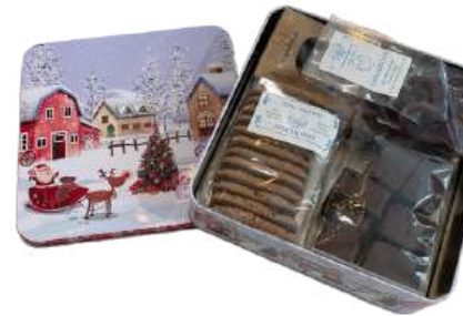
Tin boxes pages 31-34